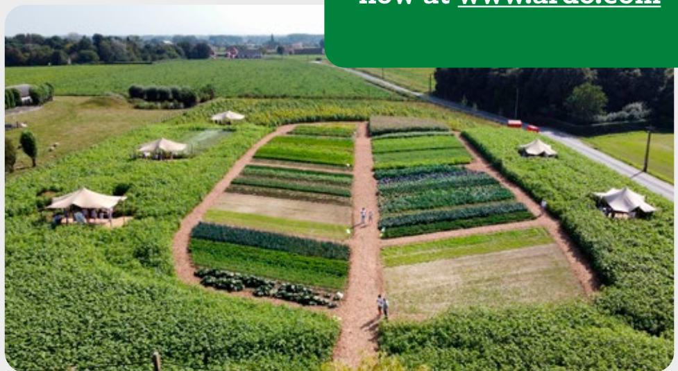
Let's Meet in the Field event in september 2023

We also want to combat climate change through the MIMOSA+ programme , whose aim is to restore soil health and implement regenerative farming