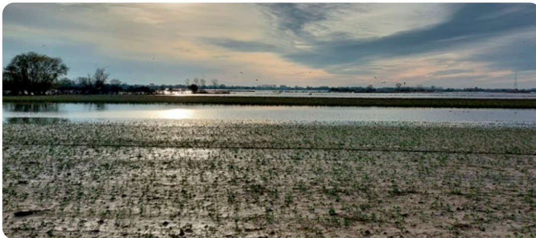
Fully flooded fields in West-Flanders, Belgium

The good news is coming from our herbs factories, were most of the annual species have been successful. The selection of new resistant varieties and the implementation of new growing techniques seems to be fruitful and promising for the coming seasons!