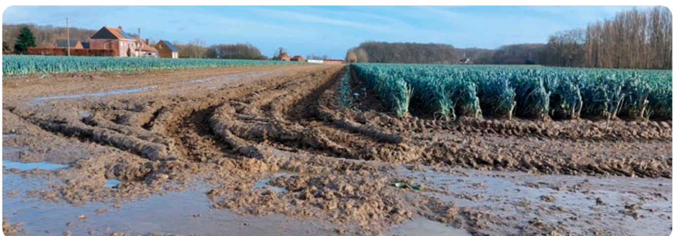
Flooded leek field near our factory in Ardoois, Belgium